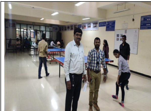
Students playing Carom and Table Tennis