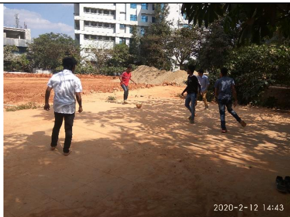
Students playing Football