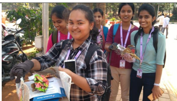
NSS activity under progress